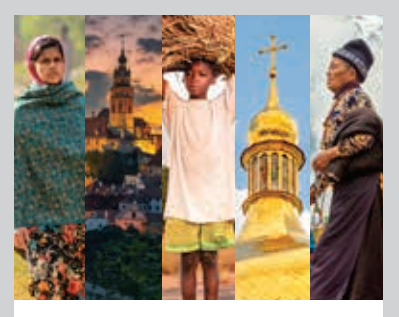
LOTTIE MOON CHRISTMAS OFFERING® CHURCH GOAL: $650,000