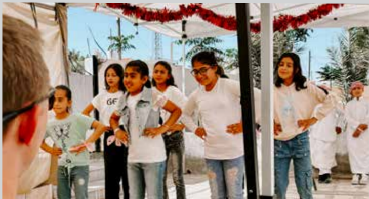
Visiting a community center.

While in Jordan, the team visited a community center that provides education and regular meals for Syrian refugee children.