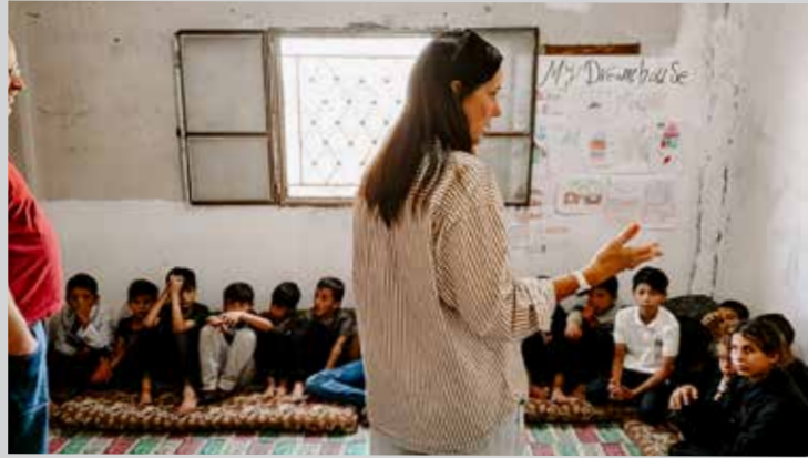
Telling the local children about Jesus.