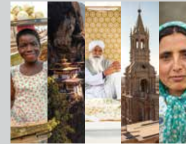
LOTTIE MOON CHRISTMAS OFFERING* CHURCH GOAL: $500,000