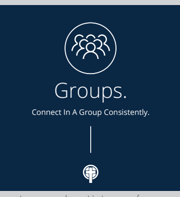
east cooper bapt is t. com/groups